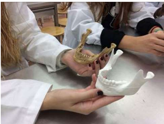
Fig. 10 3D model of the jaw printed with polylactic acid (PLA), compared with a real piece

For teaching in faculties, its use has been disseminated in recent times, both in learning and allowing students access to these technologies [23]. In the field of medicine the use of 3D technologies is widespread, there are several fields in which they are useful in the preparation of surgical interventions as well as in the assessment of clinical pathologies [24–26]. In the teaching of anatomy along with using for the learning and training of undergraduate students [16] in the faculties of Health Sciences, these are also being employed in different