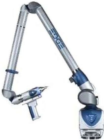
Fig. 6 Faro Edge Scan Arm HD model arm scanner

fabrication) printer used was the ColidoX 3045 model (Fig. 8).