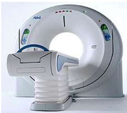
Fig. 1 Aquileon 64 CFX computerized tomograph for scanning of anatomical parts

Another modality of digitalization of bone pieces was through the use of handheld scanner, Artec Eva (Fig. 2), which allowed obtaining high resolution 3D images of scanned anatomical structures. The scanner provides 0.5 mm resolution with 0.1 mm dot accuracy, processing capacity of 4,000,000