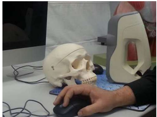
Fig. 2 Hand scanner model Artec Eva used for the digitalization of bone pieces

triangles/GB Ram, data acquisition speed of 2 million points/s and 1.3 mp of texture resolution.