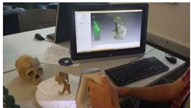
Fig. 3 Digitization of bone pieces with Artec Eva model hand scanner and graphic workstation

This scanner allows observing the anatomical model in real time while working in the incorporated fusion mode (Fig. 3) and also aligns the scanned data with great precision. The software that incorporates this Artec Studio 3D scanner is user-friendly and allows it to be easily integrated with the Systems Geomagic Desing X 3D computer-aided program. This software supports importing more than 60 formats and combination of data obtained with the scanner, which allows creating solid editable models. By digitalizing the object, a point cloud is obtained, posteriorly treating by Geomagic Desing X transforming the point cloud by triangulation into a polygonal planes mesh, which is treated by adjusting dimensions, eliminating damaged areas to obtain high quality image. After finishing the meshing process, we proceeded to create the model in STL format (stereoLithography) that passed to the layering program, CURA, in order to create the layering codes read by the 3D printer. For digital processing of scanned anatomical piece, Dell Latude E5440 model notebook with the corresponding software was used as a workstation (Fig. 3).