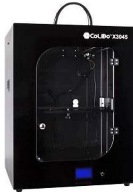
Fig. 8 Printer model ColidoX 3045, used for our study

the bone piece (Fig. 9). The high quality model will allow anatomy students use it for better learning (Fig. 10).