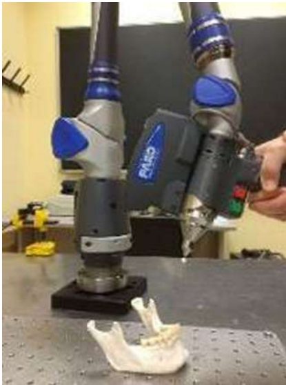
Fig. 4 Arm Scan Platinum model scanner digitalizing the jaw