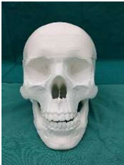
Fig. 9 3D model of the skull printed with polylactic acid (PLA)

the students to the complete osseous anatomical parts, thus supplying the details on the morphological deficiencies and deteriorations found in original structures, which in many cases are found in the anatomical departments [16]. The quality of these anatomical models printed in 3D, is increasing due to the materials used, which are more similar to the real piece and partly to the acquisition of images by means of very precise scanners with increasingly advanced techniques [17–22].